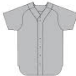
RAGLAN FULL BUTTON (SB56W)