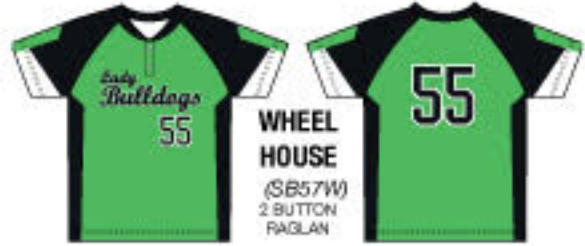
WHEEL HOUSE (SB57W) 2 BUTTON RAGLAN

COLOR 1: PINK COLOR 2: BLACK COLOR 3: WHITE