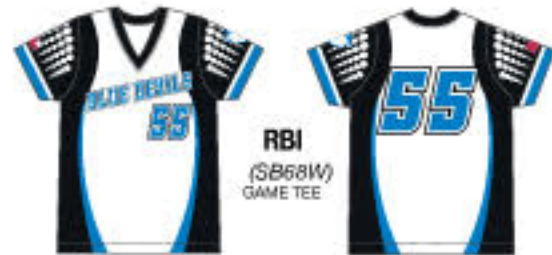
RBI (SB68W) GAME TEE

COLOR 1: WHITE COLOR 2: BLACK COLOR 3: ROYAL