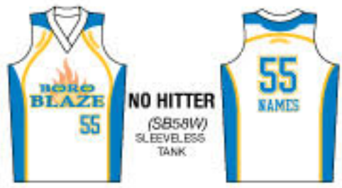
NO HITTER (SB58W) SLEEVELESS TANK

COLOR 1: WHITE COLOR 2: ROYAL COLOR 3: GOLD