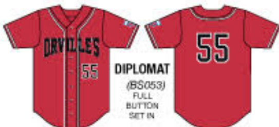
DIPLOMAT (BS053) FULL BUTTON SET IN

COLOR 1: 75% BLACK COLOR 2: WHITE COLOR 3: ROYAL