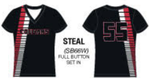
STEAL (SB66W) FULL BUTTON SET IN

COLOR 1: RED COLOR 2: BLACK COLOR 3: WHITE