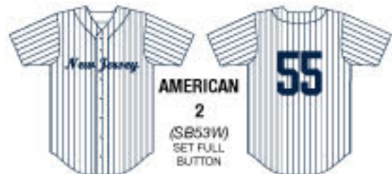
AMERICAN 2 (SB53W) SET FULL BUTTON

COLOR 1: NAVY COLOR 2: SILVER COLOR 3: WHITE