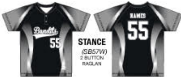
STANCE (SB57W) 2 BUTTON RAGLAN

COLOR 1: WHITE COLOR 2: BLACK COLOR 3: ROYAL