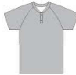
RAGLAN 2 BUTTON (SB57W)