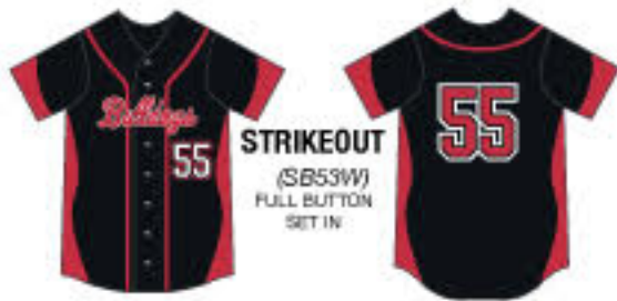
STRIKEOUT (SB53W) FULL BUTTON SET IN