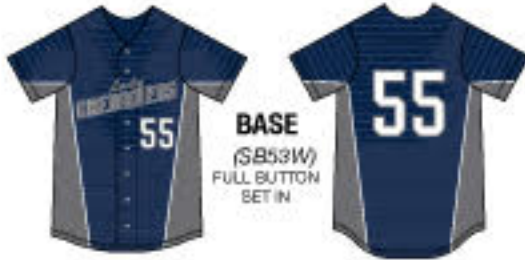
BASE (SB53W) FULL BUTTON SET IN

COLOR 1: WHITE COLOR 2: RED COLOR 3: NAVY