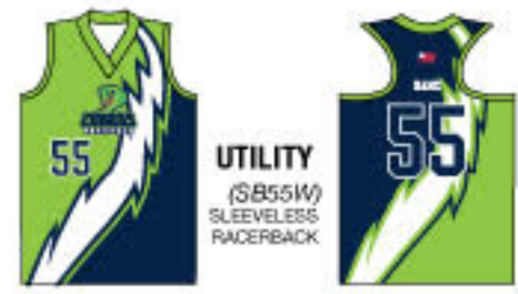
UTILITY (SB55W) SLEEVELESS RACERBACK

COLOR 1: WHITE COLOR 2: ROYAL COLOR 3: GOLD