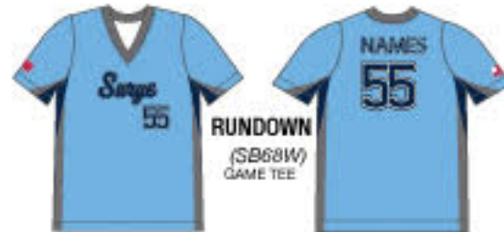
ROUNDUP (SB68W) GAME TEE

COLOR 1: BLACK COLOR 2: 50% BLACK COLOR 3: WHITE