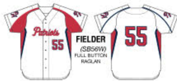
FIELDER (SB56W) FULL BUTTON RAGLAN

COLOR 1: WHITE COLOR 2: RED COLOR 3: NAVY