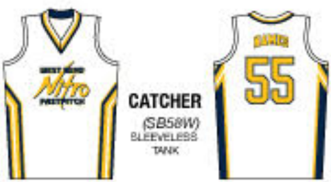
CATCHER (SB58W) SLEEVELESS TANK

COLOR 1: LIME COLOR 2: NAVY COLOR 3: WHITE