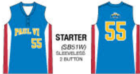
STARTER (SB51W) SLEEVELESS 2 BUTTON

COLOR 1: RED COLOR 2: BLACK COLOR 3: DIG. CAMO