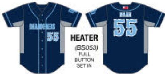
HEATER (BS053) FULL BUTTON SET IN

COLOR 1: NAVY COLOR 2: HUNTER COLOR 3: WHITE