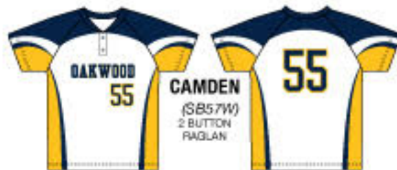
CAMDEN (SB57W) 2 BUTTON RAGLAN

COLOR 1: WHITE COLOR 2: GOLD COLOR 3: NAVY