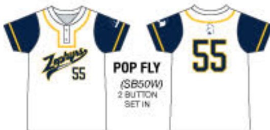
POP FLY (SB50W) 2 BUTTON SET IN

COLOR 1: SKY COLOR 2: 50% BLACK COLOR 3: NAVY