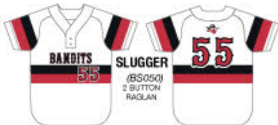
SLUGGER (BS050) 2 BUTTON RAGLAN

COLOR 1: NAVY COLOR 2: GOLD COLOR 3: SILVER COLOR 4: WHITE