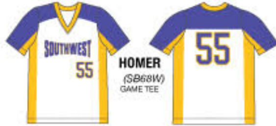
HOMER (SB68W) GAME TEE

COLOR 1: NAVY COLOR 2: 85% NAVY COLOR 3: 50% BLACK COLOR 4: WHITE