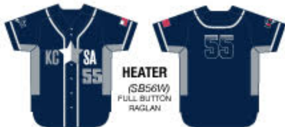
HEATER (SB56W) FULL BUTTON RAGLAN

COLOR 1: SKY COLOR 2: RED COLOR 3: ROYAL