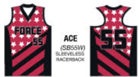
ACE (SB55W) SLEEVELESS RACERBACK

COLOR 1: BLACK COLOR 2: GOLD COLOR 3: WHITE