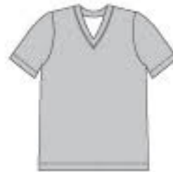
GAME TEE (SB67W, SB68W)