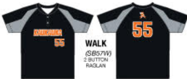
WALK (SB57W) 2 BUTTON RAGLAN

COLOR 1: WHITE COLOR 2: GOLD COLOR 3: PURPLE