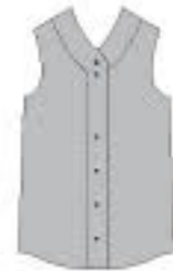
SLEEVELESS FULL BUTTON (SB54W)