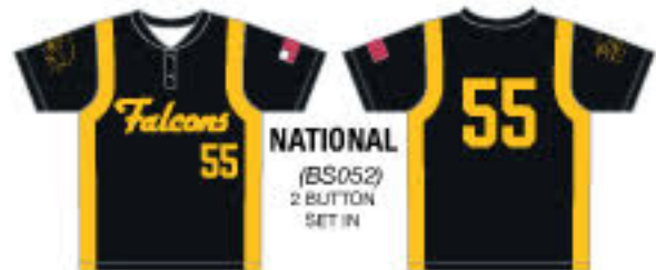
NATIONAL (BS052) 2 BUTTON SET IN

COLOR 1: WHITE COLOR 2: BLACK COLOR 3: RED