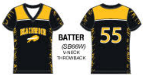
BATTER (SB66W) V-NECK THROWBACK

COLOR 1: BLACK COLOR 2: GOLD COLOR 3: WHITE