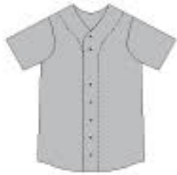
SET IN FULL BUTTON (SB53W)