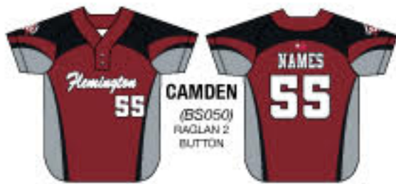
CAMDEN (BS050) RAGLAN 2 BUTTON

COLOR 1: CARDINAL COLOR 2: BLACK COLOR 3: SILVER