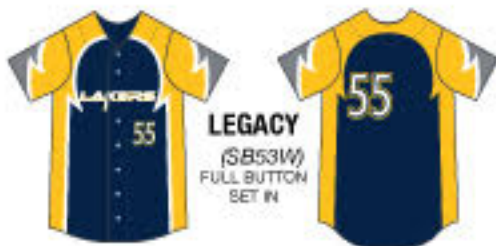
LEGACY (SB53W) FULL BUTTON SET IN

COLOR 1: KELLY COLOR 2: BLACK COLOR 3: WHITE