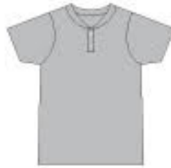
SET IN 2 BUTTON (SB50W)