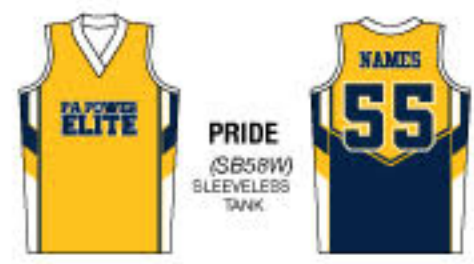
PRIDE (SB58W) SLEEVELESS TANK

COLOR 1: RED COLOR 2: BLACK COLOR 3: WHITE