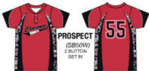
PROSPECT (SB50W) 2 BUTTON SET IN

COLOR 1: RED COLOR 2: BLACK COLOR 3: DIG. CAMO