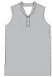
SLEEVELESS 2 BUTTON (SB51W)