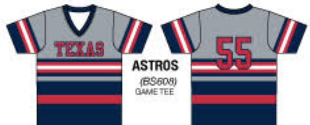
ASTROS (BS608) GAME TEE

COLOR 1: RED COLOR 2: WHITE COLOR 3: BLACK