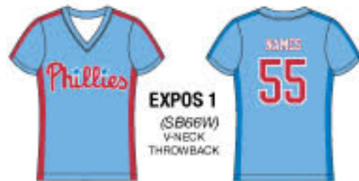
EXPOS 1 (SB66W) V-NECK THROWBACK

COLOR 1: NAVY COLOR 2: GOLD COLOR 3: 50% BLACK COLOR 4: WHITE