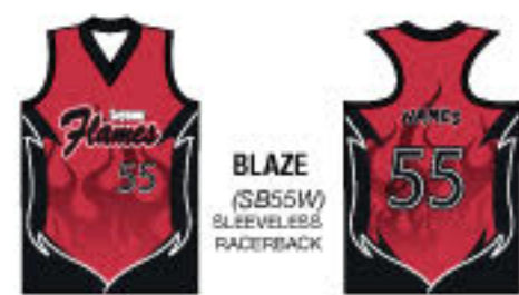
BLAZE (SB55W) SLEEVELESS RACERBACK

COLOR 1: WHITE COLOR 2: GOLD COLOR 3: NAVY