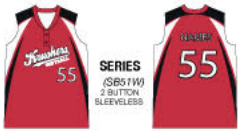
SERIES (SB51W) 2 BUTTON SLEEVELESS

COLOR 1: RED COLOR 2: BLACK COLOR 3: WHITE