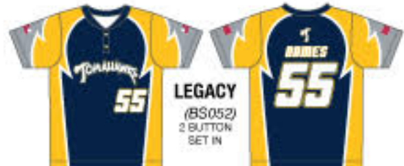
LEGACY (BS052) 2 BUTTON SET IN

COLOR 1: NAVY COLOR 2: SILVER COLOR 3: SKY