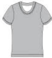
THROWBACK (SB65W, SB66W)