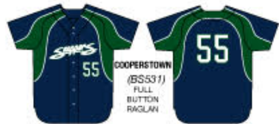
COOPERSTOWN (BS531) FULL BUTTON RAGLAN

COLOR 1: CARDINAL COLOR 2: BLACK COLOR 3: SILVER