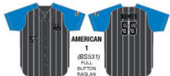
AMERICAN 1 (BS531) FULL BUTTON RAGLAN

COLOR 1: BLACK COLOR 2: 75% BLACK COLOR 3: WHITE