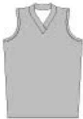
SLEEVELESS (SB52W, SB58W, SB55W)