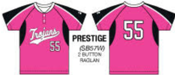
PRESTIGE (SB57W) 2 BUTTON RAGLAN

COLOR 1: ROYAL COLOR 2: RED COLOR 3: WHITE