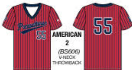
AMERICAN 2 (BS606) V-NECK THROWBACK

COLOR 1: BLACK COLOR 2: 75% BLACK COLOR 3: WHITE