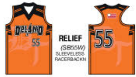
RELIEF (SB55W) SLEEVELESS RACERBACK

COLOR 1: BLACK COLOR 2: RED COLOR 3: WHITE